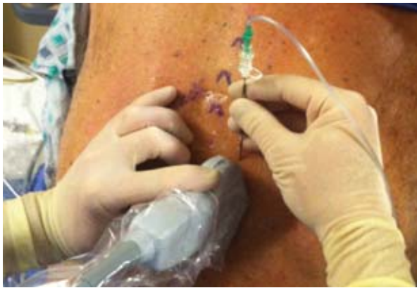
Figure 2a. Ultrasound-guided classic approach.

Intercostal. In this approach, an 18-gauge Tuohy needle is introduced between 2 ribs corresponding to the desired paravertebral level 8 cm from the corresponding spinous process. After the rib is contacted, the needle is oriented at a 60-degree angle and introduced medially for another 2 cm with the bevel oriented medially. Three milliliters of local anesthetic is injected slowly after negative aspiration for blood before the introduction of the catheter. The catheter is introduced 6 cm beyond the tip of the needle. 45