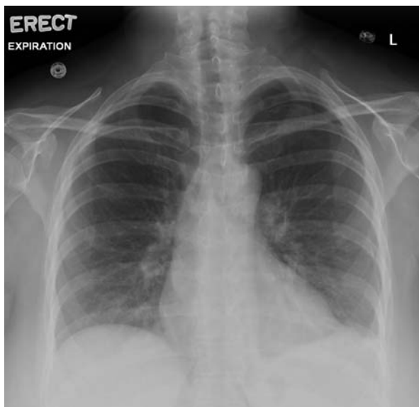
Figure 6. Chest x-ray illustrates 15% pneumothorax following continuous paravertebral block. No chest tube was placed.

The paravertebral catheter is infused with either bupivacaine 0.0625% or lidocaine 0.25% at a starting rate of 7 mL per hour. The rate can be increased to 10 mL per hour if necessary. Orders should also include a bolus of 3 mL per hour, as needed, given by the nurse. The advantage of lidocaine is that it is safer, and when in doubt, determining the plasma level of the drug is simple. Ropivacaine 0.2% also has been reported as an alternative for continuous infusion. Regardless of the solution, the total rate should not exceed 20 mL per hour.