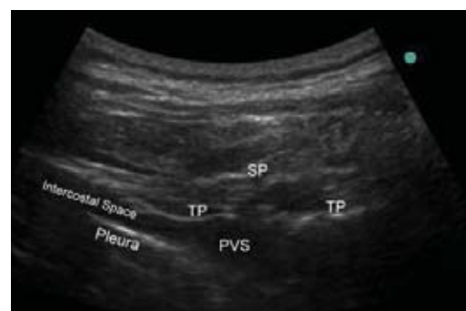
Figure 5. Proximal lateral approach with horizontally oriented probe and needle position (top), with corresponding sonoanatomy (bottom).