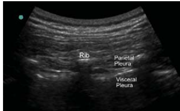
Figure 3. When the transducer is too lateral, the paravertebral space appears narrower.