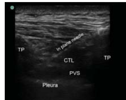
Figure 2b. Ultrasound-guided classic approach.

Left: The ultrasound transducer is positioned longitudinally at the level of the spinous process.