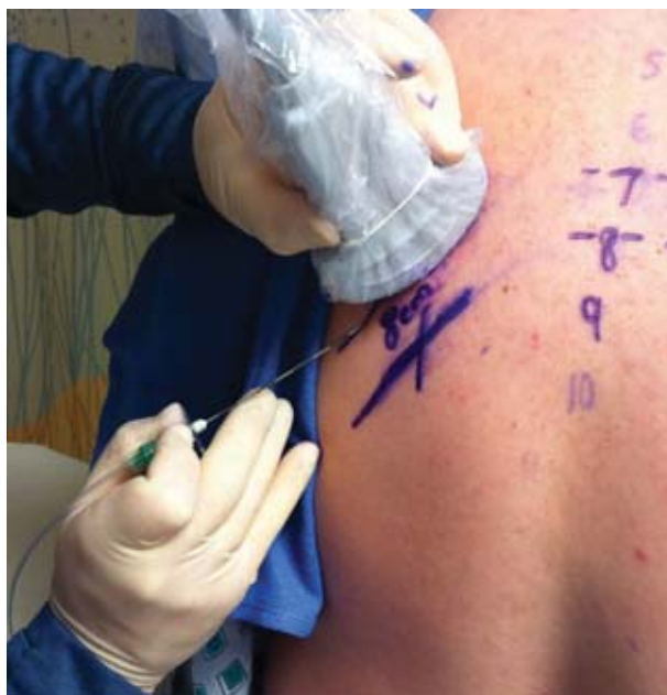
Figure 4. Intercostal approach to the paravertebral space. The line indicates the space between ribs 6 and 7.

The probe is placed perpendicular to the longitudinal plane of the spinous processes (Figure 5). The needle is introduced in-plane in a medial direction. This approach