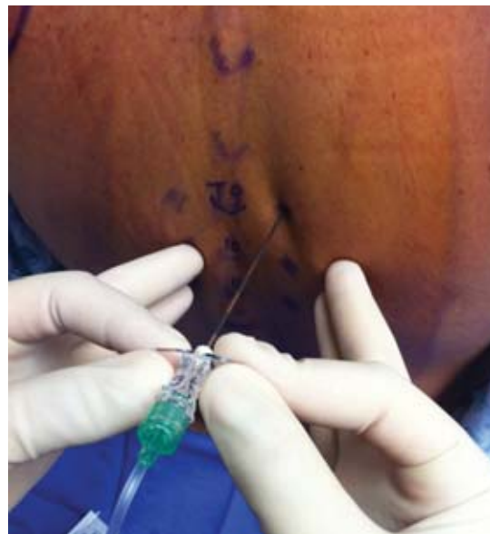
Figure 1. Classic approach for single blocks.

For the past 10 years, clinicians at UPMC have performed peripheral nerve blocks and PVBs in patients receiving thromboprophylaxis for deep vein thrombosis and pulmonary embolism either postoperatively or because of multiple rib fractures. The combination of CPVBs and thromboprophylaxis has not been associated with any significant bleeding, particularly at the time of the removal of the paravertebral catheter. At UPMC, administration of the thromboprophylaxis is not discontinued and these catheters are removed without consideration for the type of drug used for thromboprophylaxis or the timing of administration. 36-39