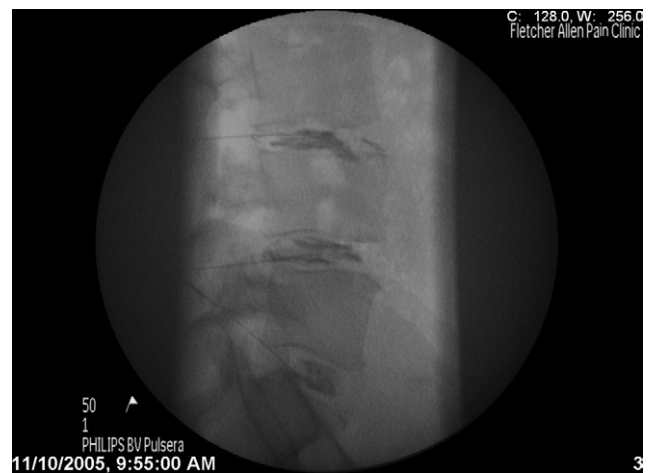
Figure 3 Lateral image of the 3 lower lumbar disks after needle placement.