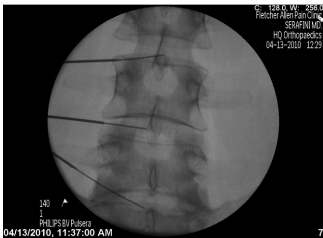
Figure 1 Lumbar discography using a double needle technique.

and craniocaudal angulation to reveal the middle third of the intervertebral disk space and to provide visualization of the vertebral end plates adjacent to the intervertebral space being evaluated. The disk is accessible by placing the needle just anterior to the superior articulating process at the desired level. A 2-needle coaxial approach contralateral to the patient's usual pain is then used to access the nucleus pulposus. The use of antibiotics and a 2-needle technique (Figure 1) are precautionary measures proposed to reduce the risk of infection. 69,70 Entering from the side contralateral to the patient's usual pain is preferred to avoid confusing disk pain from procedural pain related to needle placement. Intermittent fluoroscopy should be used for advancement of the needle into each desired disk. Upon entrance into the disk, anteroposterior and lateral fluoroscopic views should be taken to confirm that the needle tip lies in the middle third of the disk. Once the final needle position has been confirmed, radiographic contrast dye, with or without an