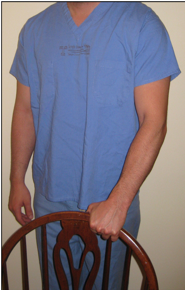
Figure 1 The chair test is positive when lateral elbow pain is elicited during the lifting of a chair with a pronated hand.

dominant wrist. In addition to biokinetic alterations, equipment adjustments also may reduce symptoms; racquets that are lighter, that are less tightly strung, or that have more strings per unit area transmit milder loads to the elbow. Manufacturing companies cite Nirschl and Pettrone's 15 recommendation of proper grip size, which states that the optimal size of the circumference of the grip is estimated by the length from the proximal palmar crease to the tip of the ring finger along the radial border; although the media often attributes suboptimal grip size to the development of tennis elbow, a recent study 23 showed that electromyographic activity of the wrist extensors muscles is not affected by variations within a ¼ inch of Nirschl and Pettrone's 15 estimate.